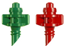
1.3 mm 1.5 mm