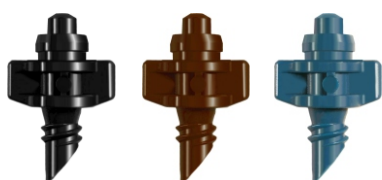
0.8 mm 0.9 mm 1.0 mm