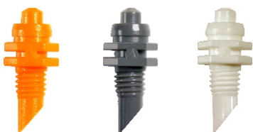
1.8 mm 2.0 mm 2.3 mm